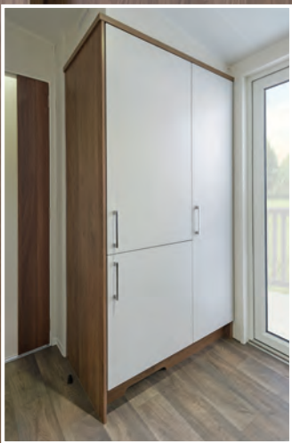
TV, kettle and toaster not included Central heating optional extra