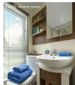
Family shower room