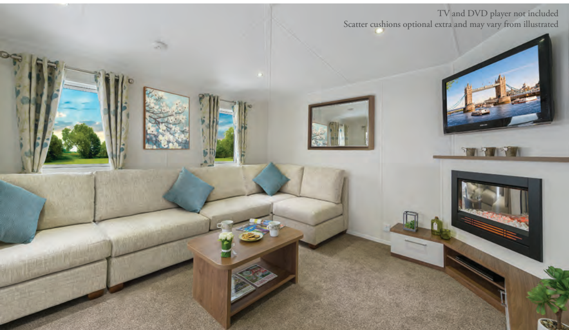
TV and DVD player not included Scatter cushions optional extra and may vary from illustrated