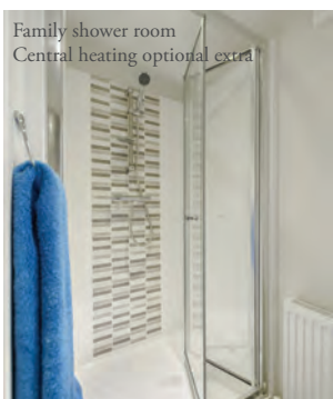
Family shower room Central heating optional extra