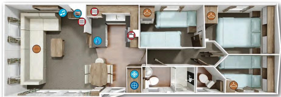
35 x 12' 6" 3 bedroom sleeps 8

THERMAX For insulation/window upgrades see page 69