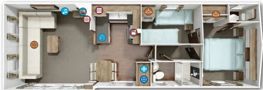
35 x 12' 6" 2 bedroom sleeps 6